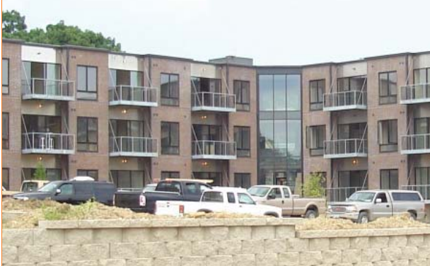
INGERSOLL SQUARE: des moines, ia FEATURED: wall insulation