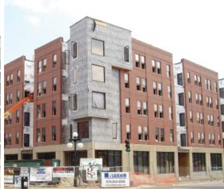
4TH & COURT LOFTS: des moines, ia FEATURED: wall and ceiling insulation