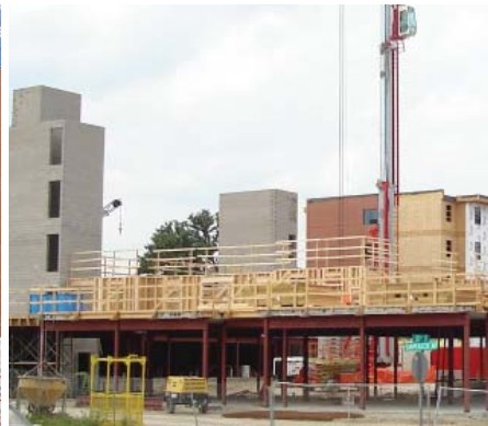
DRAKE HOUSING PROJECT: des moines, ia FEATURED: material supply