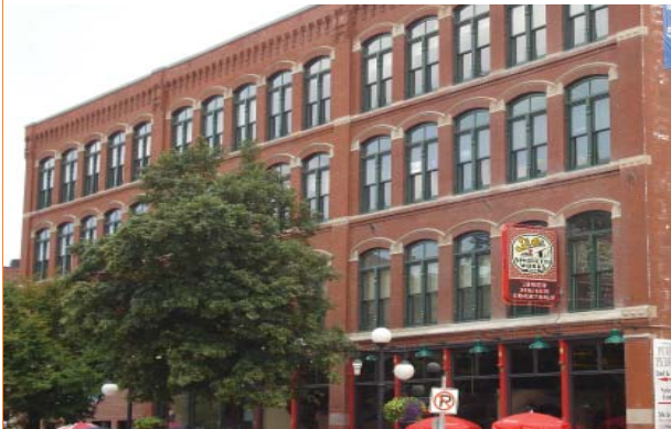
SPAGHETTI WORKS: des moines, ia FEATURED: foam, firm fill, and sound mat